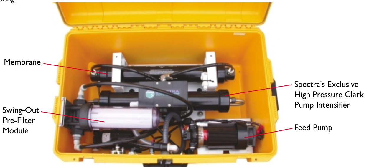
Aquifer 150M top view, case open