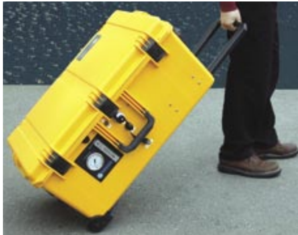
Aquifer 150 and 360 are compact and designed to transport easily

on your favorite anchorages, beaches, or bays. Set-up is quick and easy, and so is maintenance. In just minutes after set-up you will be enjoying fresh drinking water, with plenty left for bathing and cooking.